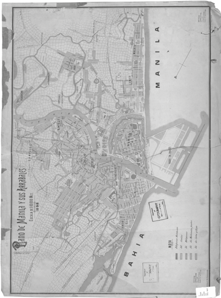
1898 De Gamoneda's Map