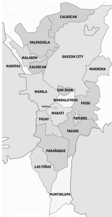
Metro Manila's Current Administrative Map (Adkranz, 2014)